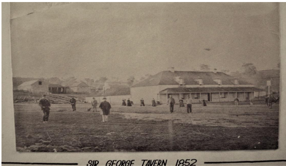
SIR GEORGE TAVERN 1852